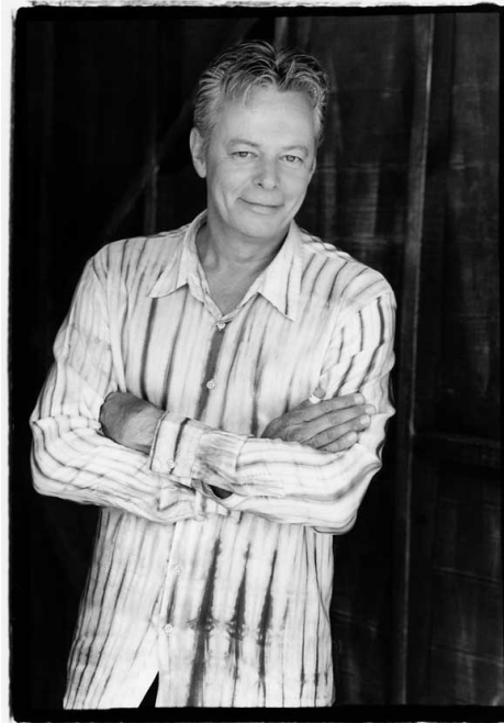
Emmanuel returns in 2007 – Since 2000, Australian Tommy Emmanuel has been entertaining Bluegrass fans with his Chet Atkins-style picking at the Walnut Valley Festival.

Advance tickets are available by calling the Walnut Valley Festival office at 620-221-3250.