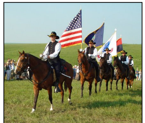
Tradition and colors fly – A mounted color guard contingent from Ft. Riley display the flags of our land. The riders and a chuck wagon crested on a distant hill and created a picture from the past.

Early arrivals at the concert site took advantage of guided wildflower walks, covered wagon rides and first-person historical interpretations. Or they lounged in the big tent and looked over exhibits by Audubon of Kansas, the Kansas Native Plant Society, the Kansas Geological Survey, the Wabaunsee County Historical Society, the Kansas Astronomical Organizations, Kansas Watersheds, or one of three Conservation Easement Programs: The Nature Conservancy, Kansas Land Trust, and Kansas Ranchland Trust.