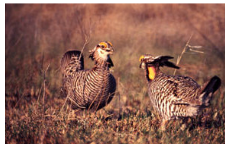
Booming Greater Prairie Chickens

As stated in the Digest: "The Tallgrass 'Prairie Parkway' trail runs more or less north to south from Nebraska to Oklahoma in the east-central part of Kansas. The route passes through the Flint Hills, the largest tract of intact or near-intact tallgrass prairie left in the United States. It's an area the size of