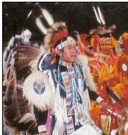
Tribe members compete in various dances at the pow-wow.

Wah-Shun-Gah Days are held the third full weekend in June each year, with next year's date being June 20-22. The festival recognizes the history of the Kanza tribe's activities in the Council Grove area, along with other historical elements within the area.