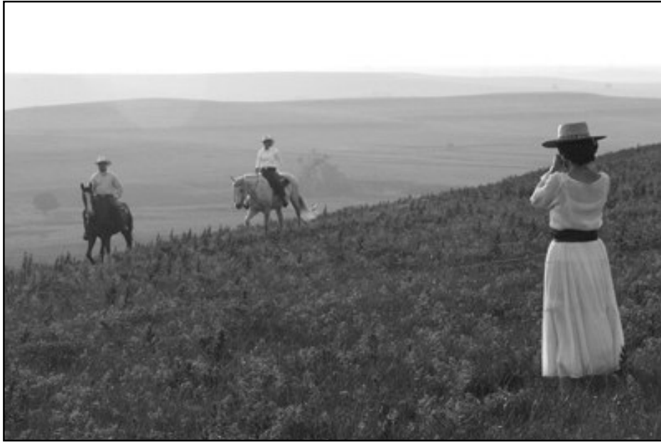
Total admiration – There was so much to admire at the Wade Pasture in Wabaunsee County. The Kansas Flint Hills put on their best show of wildflowers, native grasses and sheer beauty. The outriders and concert goers only added to the beauty.

Concert goers bought tokens (at $2 each) with which they could purchase the program, "Symphony in the Flint Hills 2007 Almanac," an 80+ page glossy publication that contained articles on Flint Hills geography, wildlife, Wabaunsee County history, Flint Hills