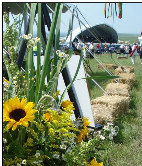
Sunflowers, straw and symphony – A wildflower bouquet, complete with our state flower, sits atop a row of straw bales - also symbolic of Kansas's wheat - which form the outer boundaries of the symphony seating area.

each town in Wabaunsee County —Alma, Alta Vista, Eskridge, Harveyville, Lake Wabaunsee, Maple Hill, and Paxico —began sprucing up and planning events and programs to celebrate the occasion. Early reports indicate that these events were quite popular, with many visitors stopping on their way to the concert site to enjoy, among other things, art exhibitions, a showing of the National Geographic Flint Hills photographs, historical museums and displays, nature walks, ranch tours, picnics and cowboy music and poetry.